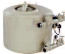
Sand and Gravel Filters