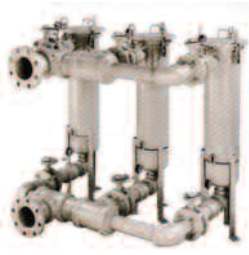
Full Flow Bag Filters

Full flow Bag Filters are an economical way to remove dirt and particulate from your cooling water system. Complete assembly includes bypass, pressure gauges and 225 micron filter bags. An optional pressure differential alarm is also available.