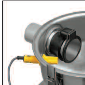
Volume Fill Switch