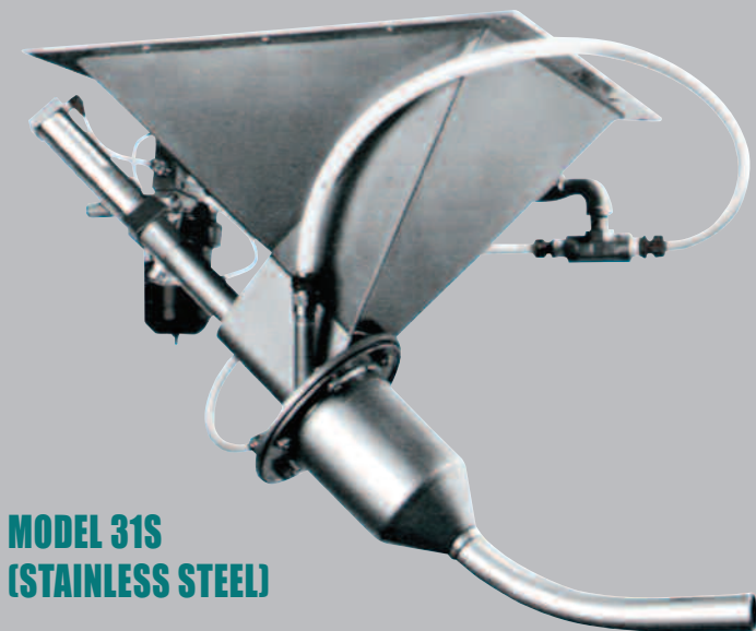
MODEL 31S (STAINLESS STEEL)

ACS Group • Walton/Stout's PowdrPump™ conveyor is a low velocity, pneumatic conveying system designed to move a wide variety of difficult powdered materials cleanly and efficiently. The finer the powder, the more effectively it works. Powered by compressed air, the conveyor moves large volumes of powder — up to 25 cu. ft./hr. with the 1" model and up to 100 cu. ft./hr. with the 2" model — at distances up to 200 feet. For applications requiring greater conveying rates, multiple units may be operated in sequence.