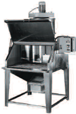
BDS-7 BAG DUMP STATION (with dust collection option)