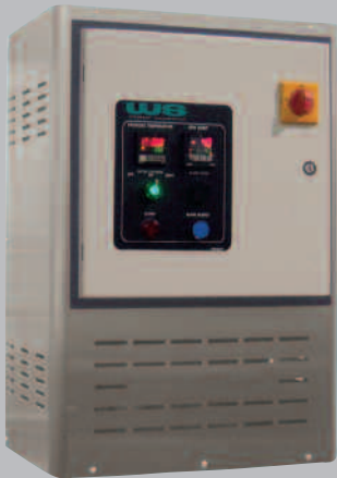
ACM30F Floor Model Dryer