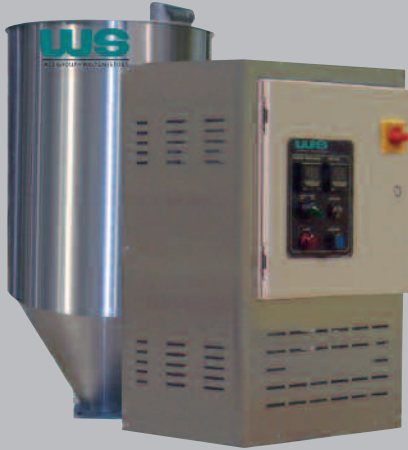
ACM30/3.0 Machine Mount Dryer with Hopper